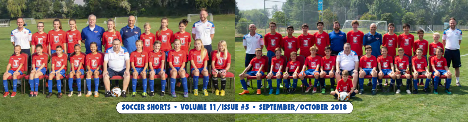
SOCCER SHORTS • VOLUME 11/ISSUE #5 • SEPTEMBER/OCTOBER 2018

A bi-monthly publication of the Kamloops Youth Soccer Association