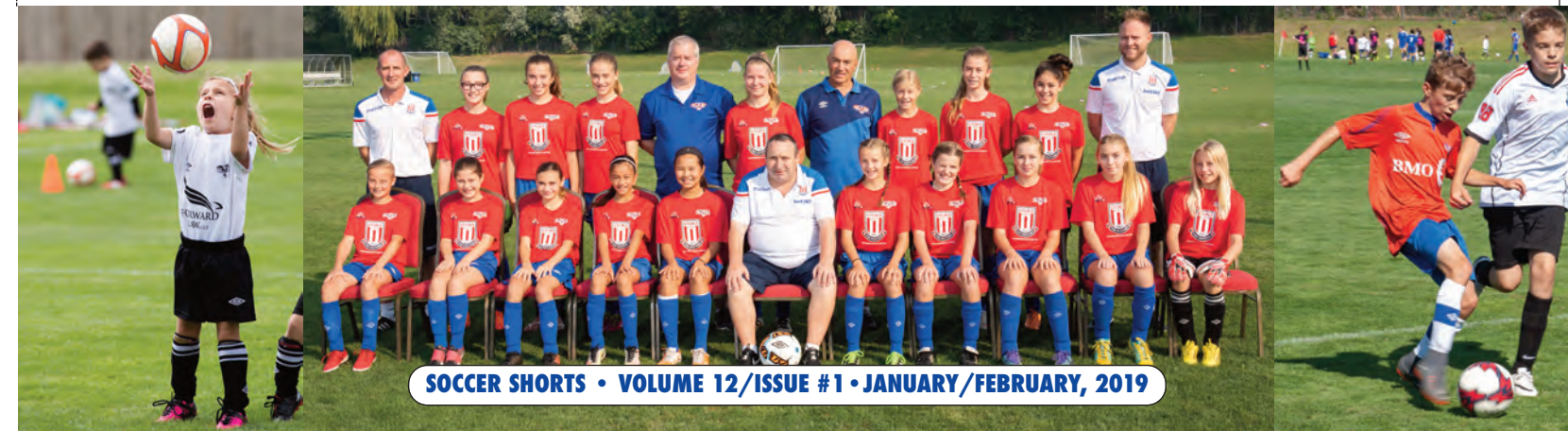
SOCCER SHORTS • VOLUME 12/ISSUE #1 • JANUARY/FEBRUARY, 2019

A bi-monthly publication of the Kamloops Youth Soccer Association